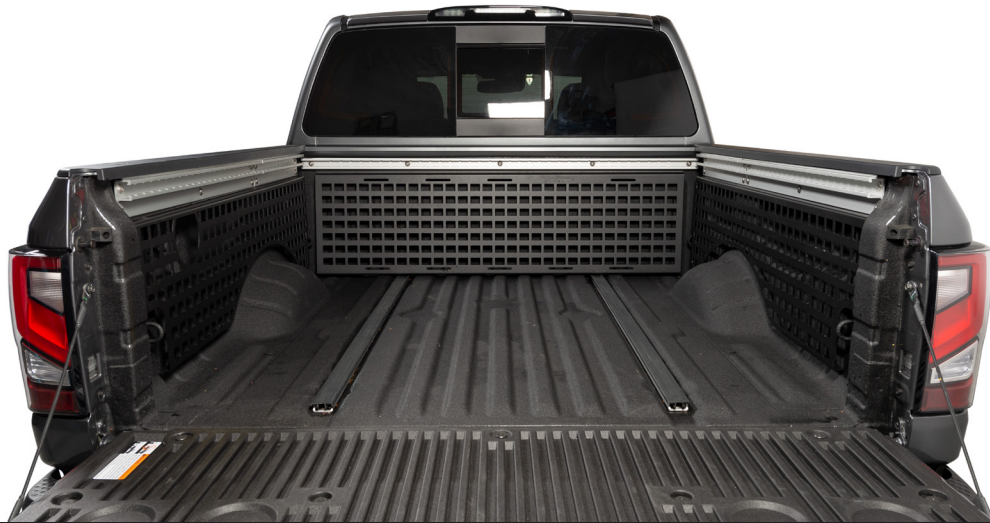
Assembled Titan MOLLE Set

Your new MOLLE Panels are now successfully installed on your vehicle!