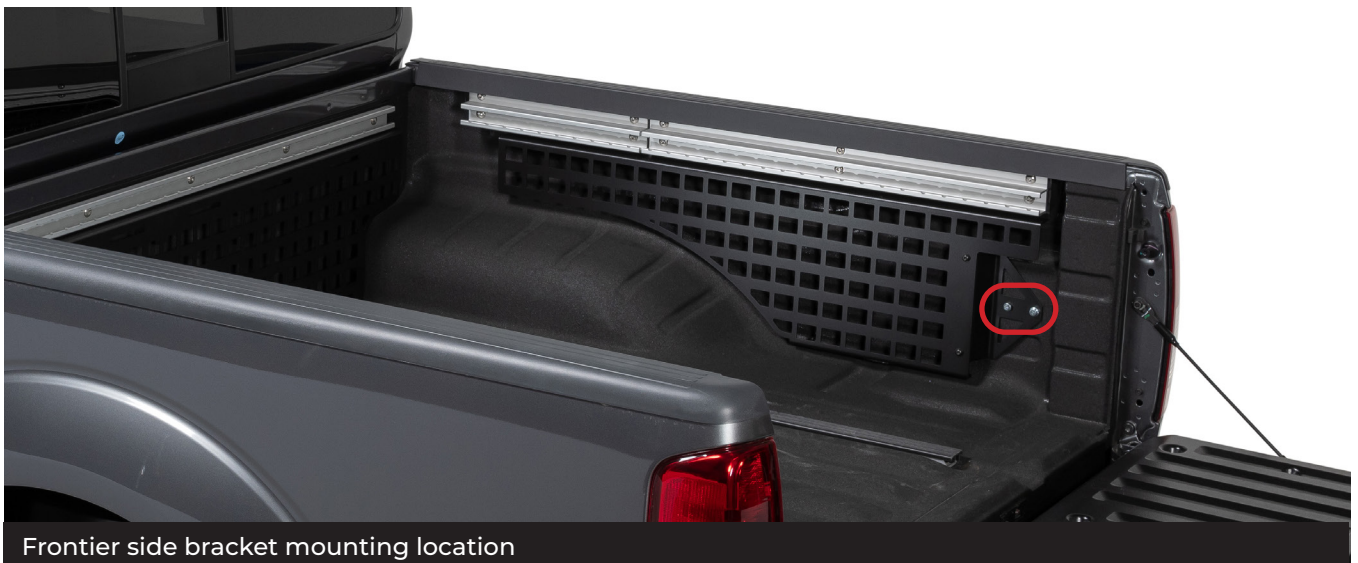
Frontier side bracket mounting location

Note: Some Nissan Frontiers do not include tie-down hooks, leaving the mounting holes blank. In this case, use a pliers or a trim-removal tool to pull out the plastic plugs where the tie-down hooks would be, then attach the side brackets using the supplied M8 bolts and a T40 Torx driver.