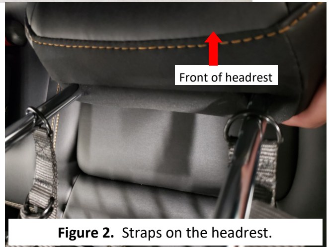
Figure 2. Straps on the headrest.