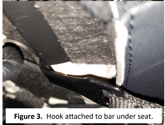
Figure 3. Hook attached to bar under seat.

Your new MOLLE Panel is now successfully installed in your vehicle!