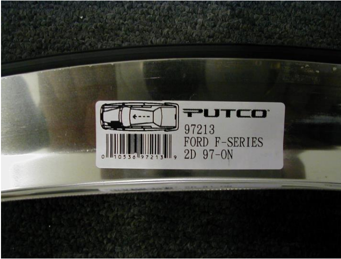
Fig. 1 (Black arrow points to trim placement)

NOTE: THE PICTURES IN THIS INSTRUCTION ARE FOR ILLUSTRATION PURPOSES ONLY.