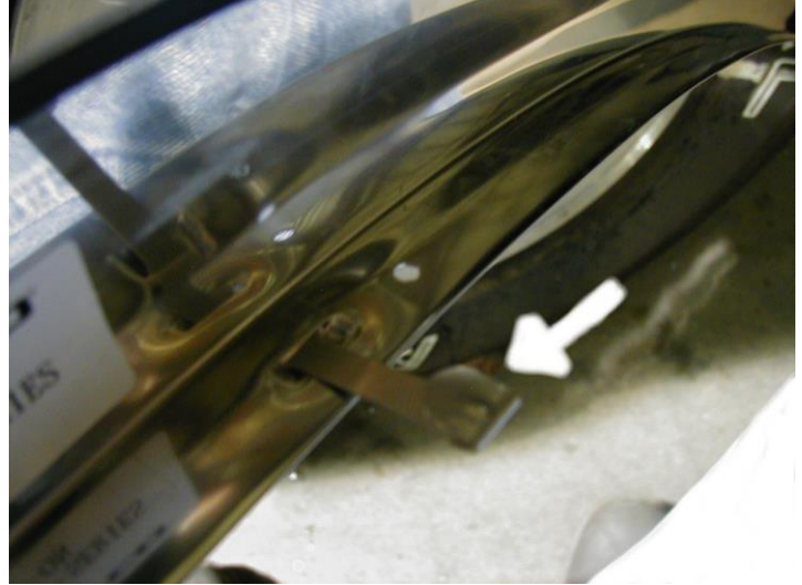
Arrow points to bent end (band should bent up)