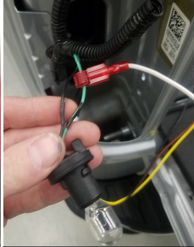
Figure 3: Reverse wire hooked to halogen backup bulb plug