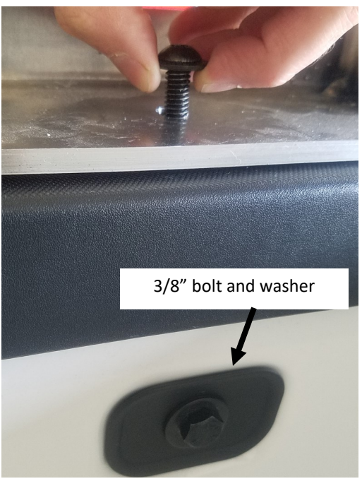
Figure 3: Threading 3.25" bolt.

10. Optional step: For extra rigidity, use drill and 5/16" drill bit to drill a hole in bed cap. Make sure headache rack is properly aligned before drilling. Use 5/16" x 1.25" long bolt and flange locknut to fasten rack to bed cap ( Figure 4 ).