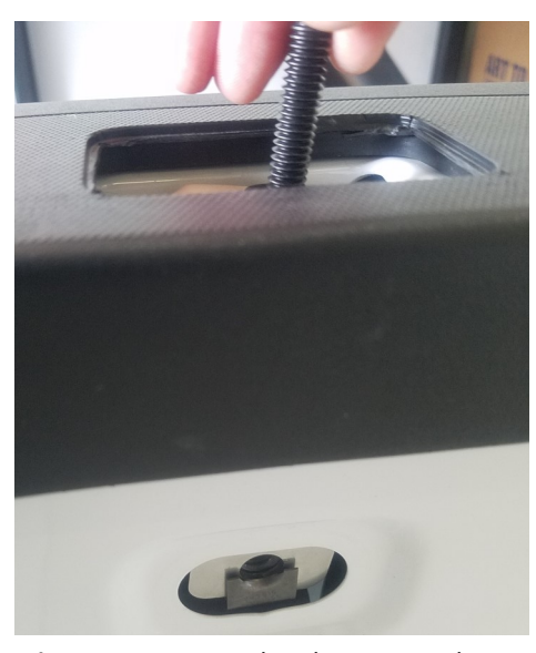
Figure 2: Lowering bracket into pocket. Nut clip facing into bed (touching bed wall) and centered in opening.

10. Optional step: For extra rigidity, use drill and 5/16" drill bit to drill a hole in bed cap. Make sure headache rack is properly aligned before drilling. Use 5/16" x 1.25" long bolt and flange locknut to fasten rack to bed cap ( Figure 4 ).